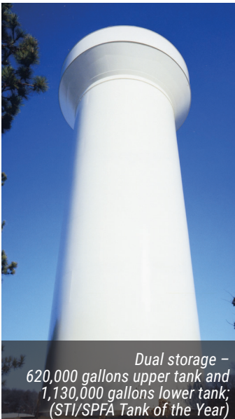
Dual storage – 620,000 gallons upper tank and 1,130,000 gallons lower tank; (STI/SPFA Tank of the Year)