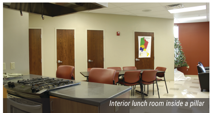
Interior lunch room inside a pillar