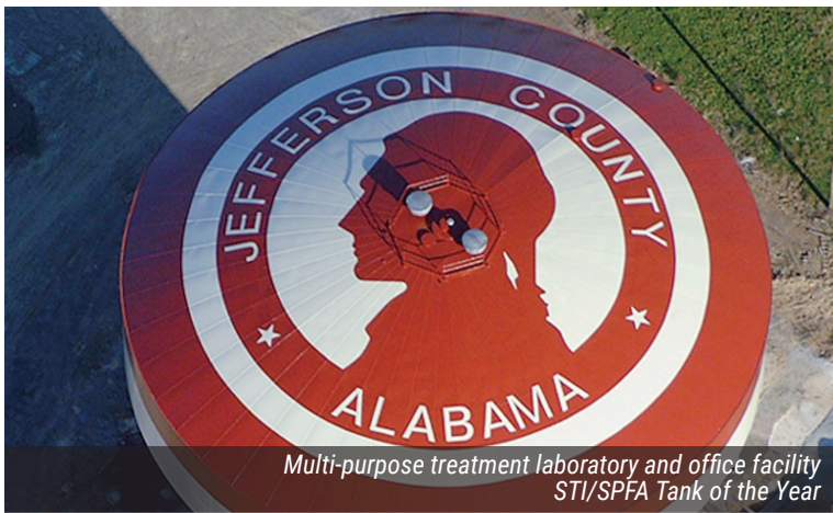
Multi-purpose treatment laboratory and office facility STI/SPFA Tank of the Year