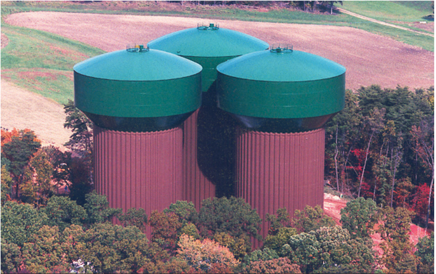
Bowie, MD – (3) 1,500,000 gallons each