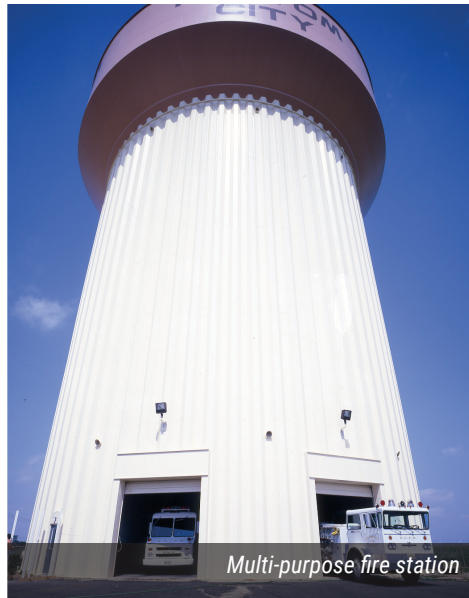
Multi-purpose fire station