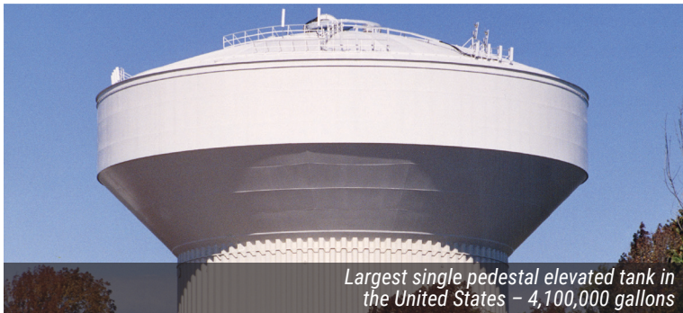
Largest single pedestal elevated tank in the United States – 4,100,000 gallons