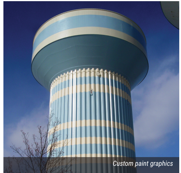
Custom paint graphics