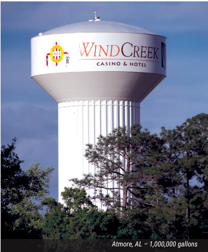
Atmore, AL – 1,000,000 gallons