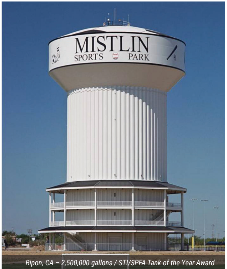
Ripon, CA – 2,500,000 gallons / STI/SPFA Tank of the Year Award