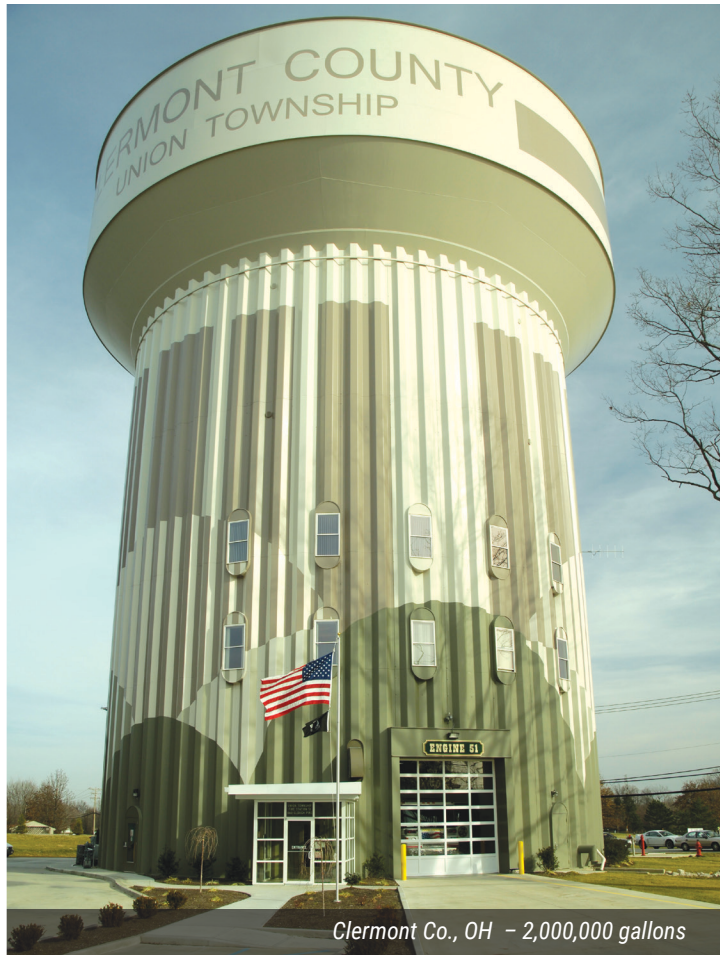
Clermont Co., OH – 2,000,000 gallons