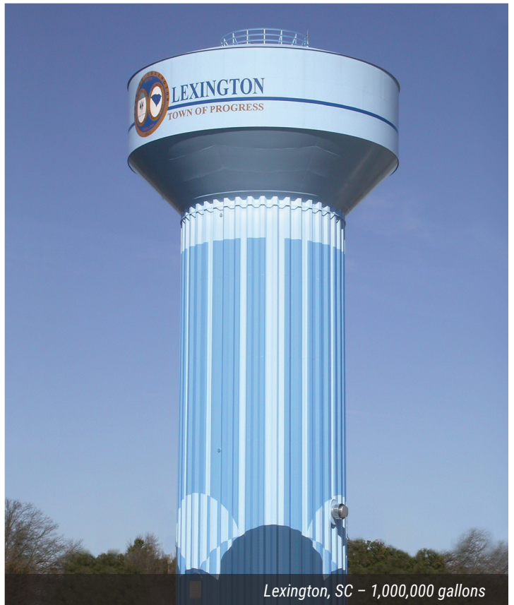
Lexington, SC – 1,000,000 gallons