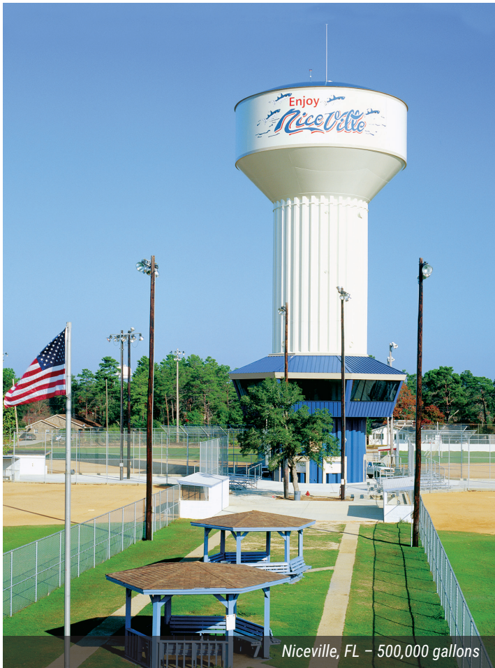
Niceville, FL – 500,000 gallons