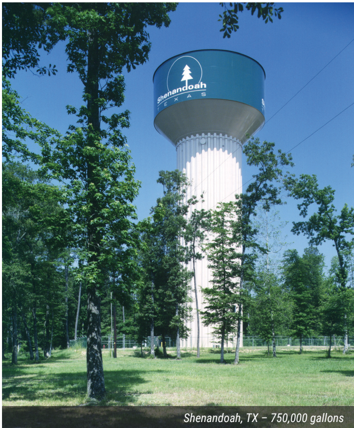
Shenandoah, TX – 750,000 gallons