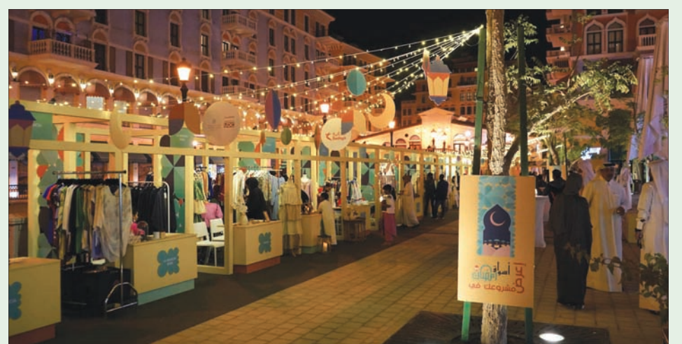
Some of the stalls participating in the Ramadan Market along the Qanat Quarter area at The Pearl-Qatar Island.